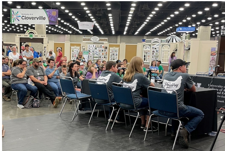
and Warren County 4-H receives a check for $100 and Pendleton County 4-H for $75.